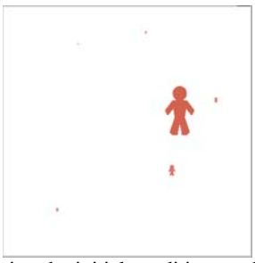
Figure 1: Two screen shots showing the initial conditions and the state of the simulation after 150 time steps under the default parameters (see Table 2). Left: The run begins with 10 groups of uniform size with an average expectation of 100. Right: After 150 time steps, there is one large group and the expectations of agents have increased to 131.5 (as indicated by the darker red shade of the agents).